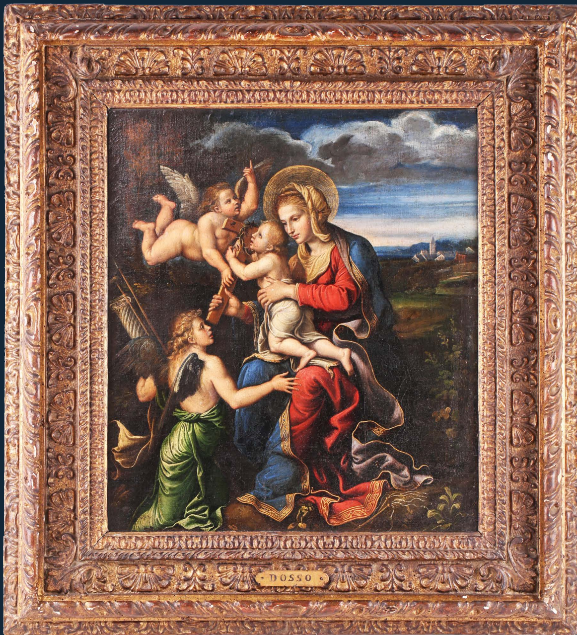
FOLLOWER OF FILIPPINO LIPPI (1457-1504), DEPICTION OF THE MADONNA & CHILD SOLD FOR £255,000